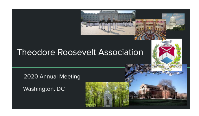
2020 Annual Meeting: October 23-25, 2020

The TR quote citation is from: Address at the Hall of the Native Sons of the American West, San Francisco – May 13, 1903