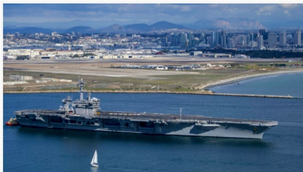
The USS Theodore Roosevelt passes North Island as it leaves on deployment in January.

Rooms can be booked NOW at the Marriott Residence Inn, 1233 1st Street, Washington, DC, SE near the Navy Yard, by calling (202) 770-2800 for reservations and ask for the special Theodore Roosevelt Association block rate. We have a limited block of rooms available for October 23 thru 25 at a rate of King Rooms, $169 and Double Queen Rooms, $189 (plus city/state/hotel taxes). These rates are available up to August 15th. The hotel offer includes a full American breakfast, free wireless internet and local phone calls. Discounted valet parking is available (current rate for discounted parking is $35/day plus tax). Note that hotel reservations can be canceled without penalty 72 hours prior to check-in. This special rate is not available by booking via hotel website; by phone only.