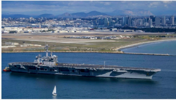
The USS Theodore Roosevelt passes North Island as it leaves on deployment in January.

home port in Bremerton, WA, in the summer of 2021. The Nimitz-class aircraft carrier, which deployed from San Diego in January, is back on patrol in the Pacific Ocean following an outbreak of coronavirus. When it transfers to Bremerton, it will enter the Puget Sound Naval Shipyard for what the Navy terms “docking planned incremental availability,” which is an extended period in dry dock for maintenance and upgrades.